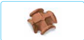
4 Way Junction