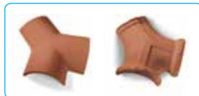
3 Way Junctions